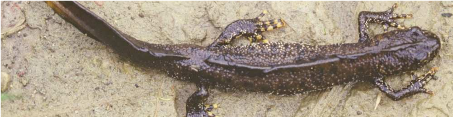
Fig. 1 Current range of Great Crested Newts ( Triturus cristatus ) in Bedfordshire