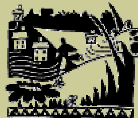
Action for Biodiversity

This newsletter is also available by email. Please contact us if you would prefer to receive it in a digital format.