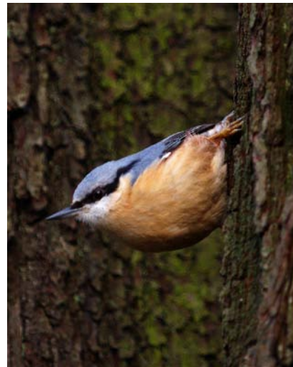
The nuthatch Sitta europaea is one of the species we're more likely to see here in Bedfordshire's gardens.

Detailed results show that you're more likely to see buzzards, coal tits, herring gulls, jays, nuthatches, hedgehogs and toads in Bedfordshire's gardens than in the rest of England. But you're likely to see more cats, too. On the other hand, our gardens see fewer barn owls, cuckoos, corn buntings, linnets, green woodpeckers, redpolls, spotted flycatchers, foxes and grey squirrels. Our four most common birds were blackbird, woodpigeon, house sparrow and collared dove. Our four least common were garden warbler, grey partridge, tawny owl and turtle dove.